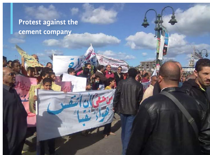
Protest against the cement company

Residents living near the Alexandria Portland Cement Plant had long complained about the factory, and how it blocked access to the sea and undermined the natural beauty of the culturally significant landscape. In 2002 when the plant's new owner, Blue Circle Industries, decided to establish a new production line less than ten meters away from residents' homes without acquiring a new license, opposition grew. 1 Neighbors noted a significant increase in fumes and dust, local children were becoming ill with respiratory diseases, and families were struggling to keep up with medical bills. 23