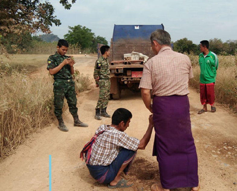
Karen Human Rights Group